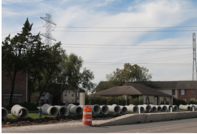
N. Main Reconstruction Project