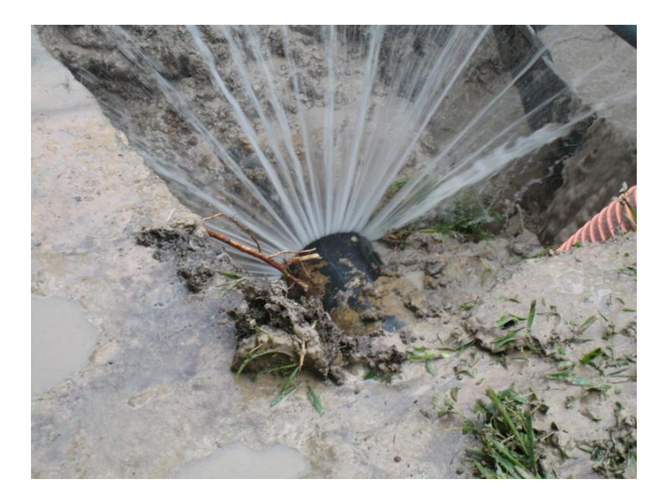
Figure 2. Circumferential Crack for 8" CI Pipe