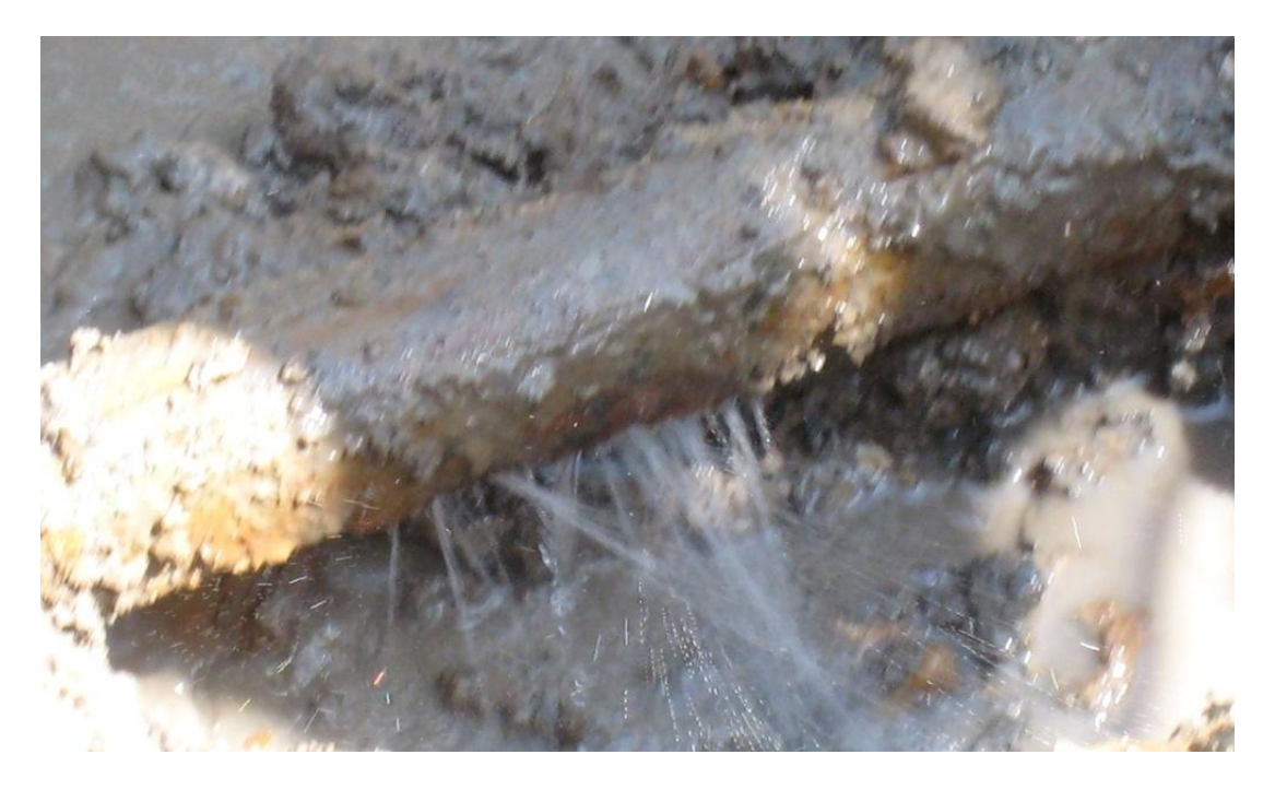
Figure 3. Longitudinal Crack 2" CI Pipe (325 W. 27<sup>th</sup> Street)