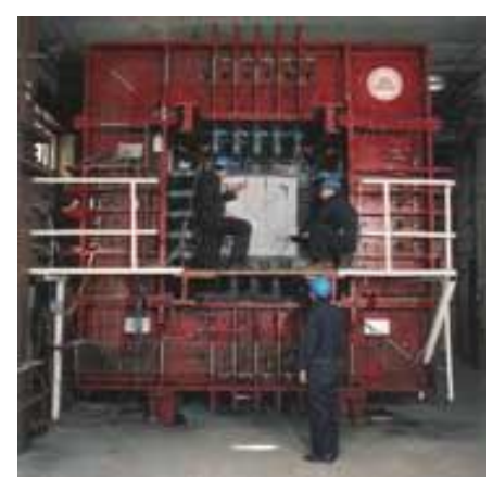
Fig.1 Universal Panel Tester

The analytical modeling of the behavior of structures under combined loadings has received considerable attention in recent years. One of the main applications is the modeling of bridge columns, beams and several other onshore and offshore RC structures, which are prone to fail in brittle manner under bending, shear and axial interaction. Concrete constitutive relations are important for analyzing these types of structures and these relations are derived from the Universal Panel Tester (Fig. 1) in University of Houston. This facility is the only one of its type in the United States, and is currently one of the two available in the world. It is also capable of performing strain-control tests and applying any prescribed types of cyclic loading beyond the yield point [1].