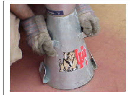
Fig 1 Slump flow test

The overall objective of this study was to compare the flow properties using various test methods and to determine the changes in flow properties with time for a SCC mix.